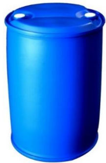
120 lit. water